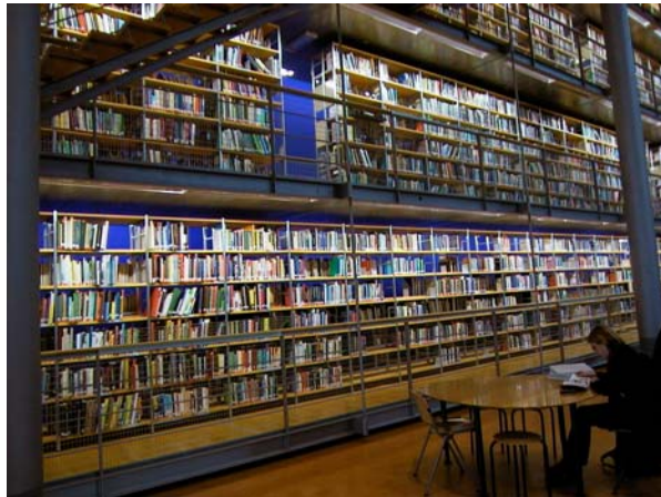
Fig. 2: Bookcase of 7x3 meter, as the information-equivalence of the human genome

continuous repair of the DNA and the presence of selection processes that hinder the passage of damages to posterity, degeneration of the order in the DNA cannot be prevented entirely. Thermodynamics predicts that the “bookcase of 7 by 3 meters” that is stored (8-fold) in every human cell ultimately will be full of errors and will become unreadable. Environmental pollution will speed up the decay, not to mention nuclear disasters or a nuclear war. The most likely place in the DNA that will become unreadable first is the Y-chromosome, which has no partner, and where the mechanism of comparison and repair are 50% less intensive than elsewhere in the DNA (Sykes, 2004).