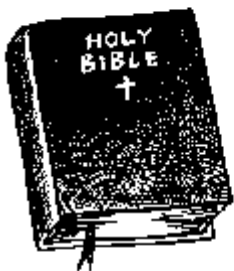
GOD'S PERFECT WORD