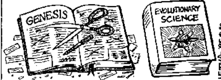
WHEN PEOPLE TRY TO MAKE THEM AGREE, GUESS WHICH ONE GETS "MODIFIED"!!