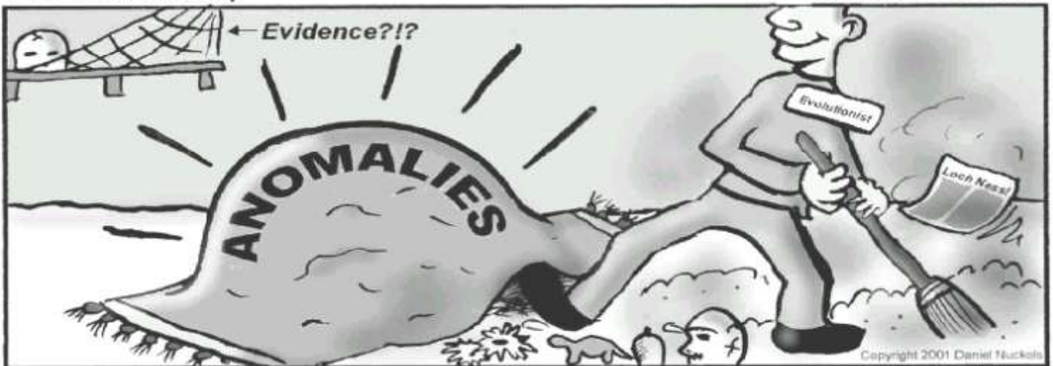
An evolutionist is really a full time janitor...

We're on Facebook www.facebook.com/pages/TCCSA/110571272303973?ref=ts TCCSA is on Instagram: @tccsa_tc and on Twitter: @TCCSA_TC. TCCSA programs are on YouTube & Rumble —links at www.tccsa.tc . DVDs are also available