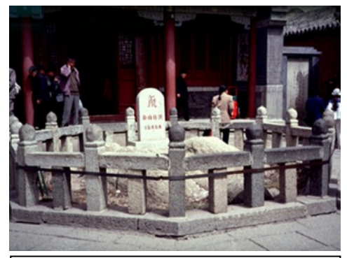
Altar on the top of Mt. Tai.

The sacrificial ceremony, also known as the 'Border Sacrifice', was performed annually on the top of Mt. Tai in Shandong province, on the eastern border of China. Therefore, it should not be surprising to find that Confucius was a believer in ShangDi