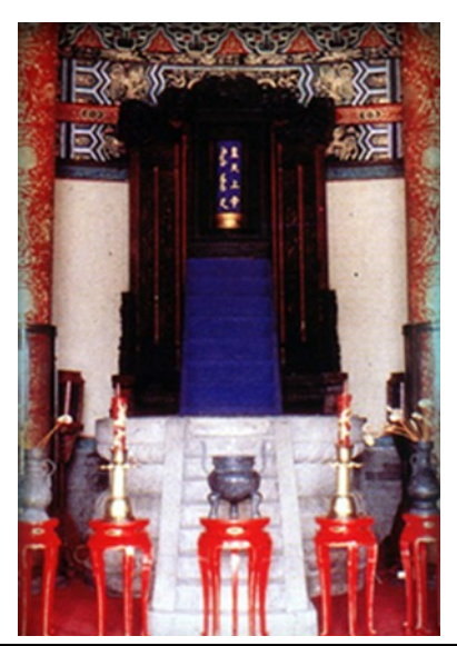
Tablet honouring ShangDi in the Hall of Prayer for Good Harvests.

at the 'Border Sacrifice'. This sacrifice took place every year at the winter solstice (December 22) and by reviewing some of the prayers and songs used in the ceremony it becomes obvious how the Chinese revered their God: